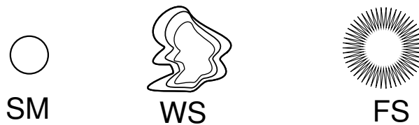
Figure 1: The three different morphologies of P. fluorescens : Smooth (SM), wrinkly spreader (WS), and fuzzy spreader (FS).

Starting from a monomorphic population of P. fluorescens , they allowed bacterial cells to grow in a static broth culture, i.e., a beaker that is not shaking. The morphology of the ancestral population could be described as “smooth”, referring to the smooth colonies it would form on a petri dish. It has been shown that two other morphologies are possible in P. fluorescens : wrinkly spreader and fuzzy spreader ( Figure 1 ).